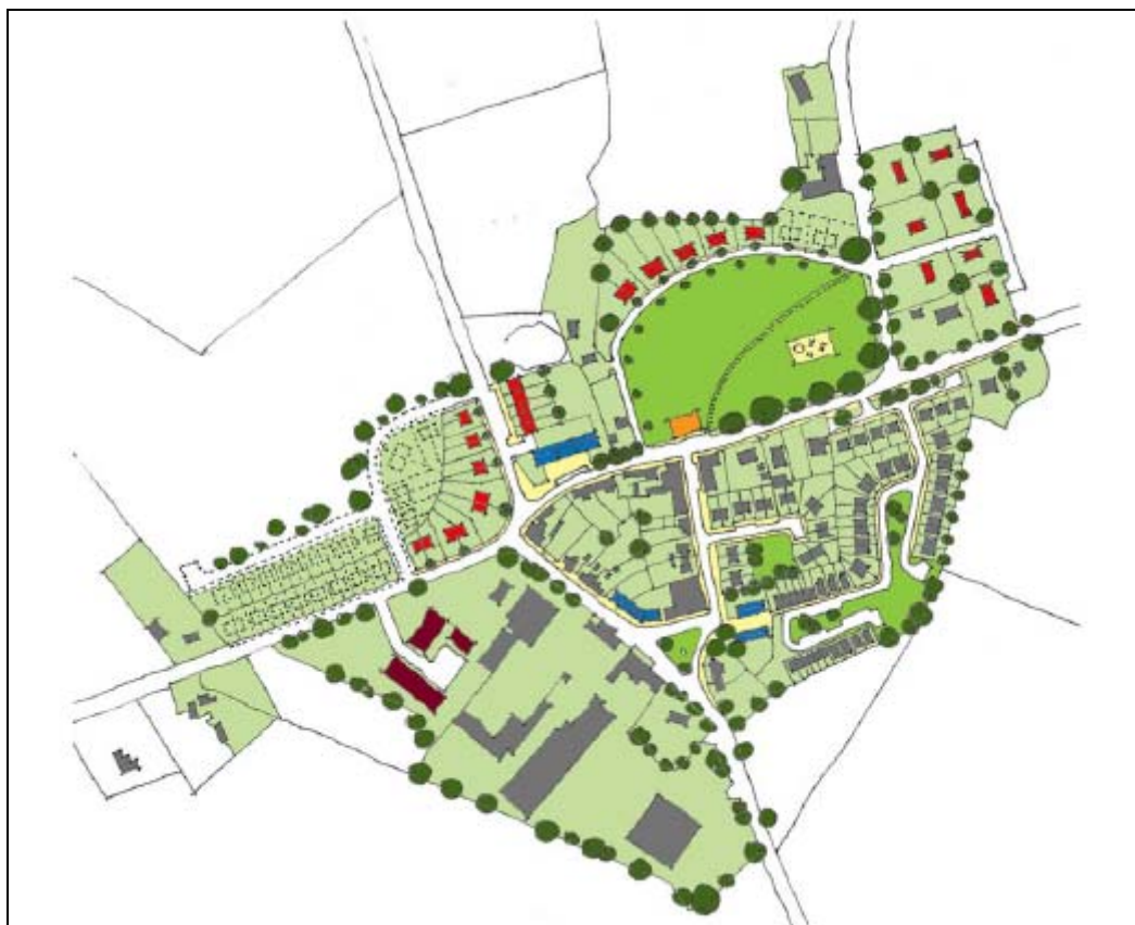
Indicative Master Plan

An Urban Design Framework for Crossakiel was developed as part of the 2009 Local Area Plan. Whilst the extent, nature and phasing of the land use zoning objectives are no longer consistent with those contained in the 2009 Local Area Plan for the village, there is considerable merit in retaining the urban design framework for the centre for the lands identified for village centre facilities and uses, the proposed village green and adjoining residential development and the expansion to the industrial development to the south west of the village centre. The Indicative Master Plan will continue to provide guidance for development management proposals in the village for the life of the County Development Plan.