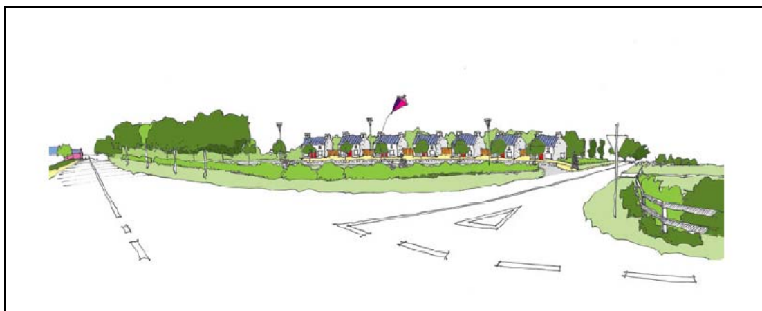
View towards Public Park and crescent of housing

The residential land use zoning for these lands has been rationalised with respect to the proposed public park to the south and the plot configurations and ownership of these lands. A crescent is proposed which requires the development of access points only through the public lands. This crescent should be of a scale and form which respects that of the village whilst providing enclosure and passive surveillance to the north of the park. This crescent should extend into the existing residential zoned lands to the east should the opportunity arise.